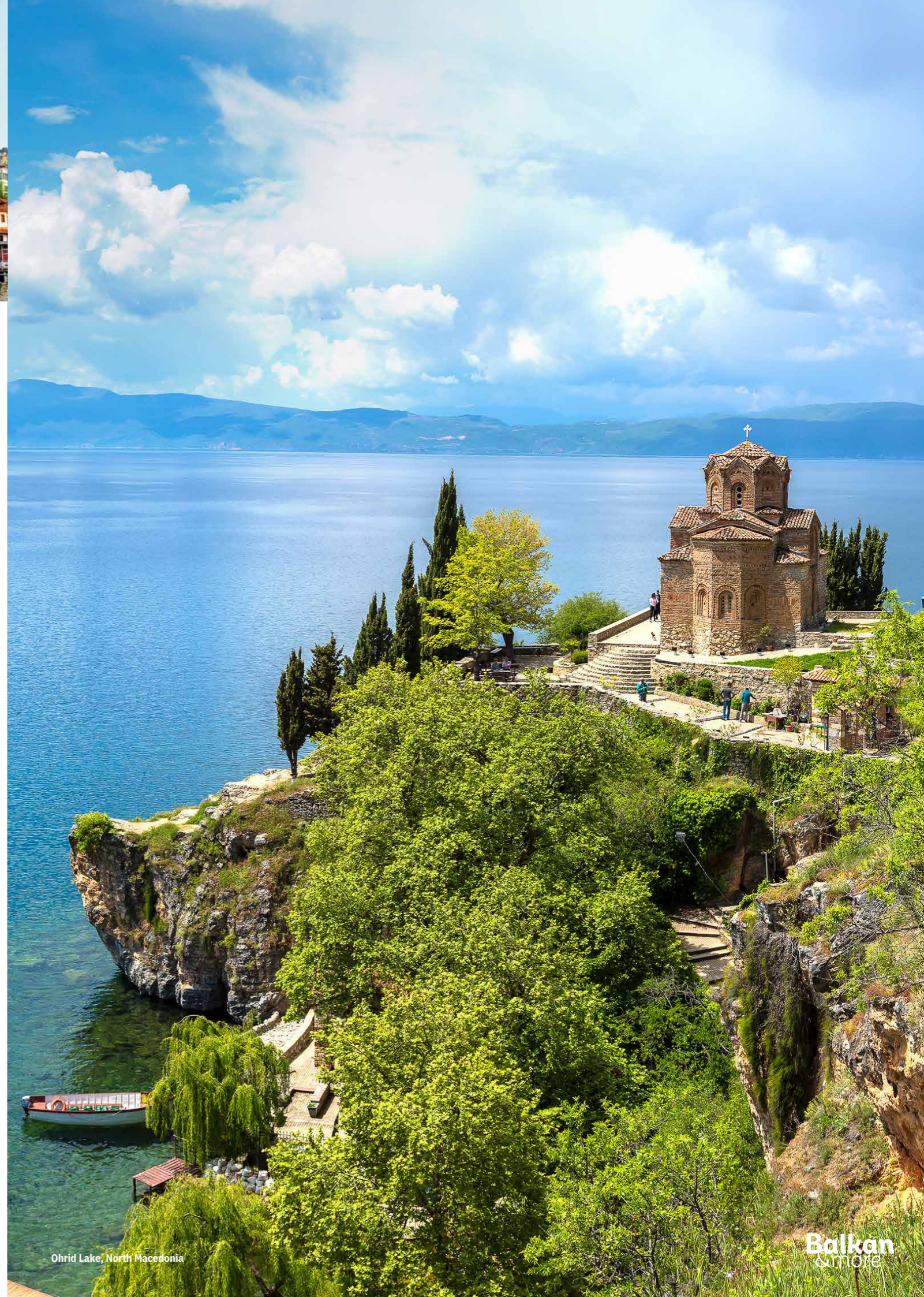
Ohrid Lake, North Macedonia