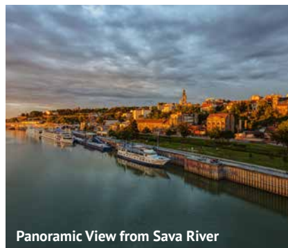
Panoramic View from Sava River

Belgrade, a capital city well known for its various architectural styles, dynamic history and fantastic views of one of the biggest river confluences in the whole of Europe. Start the tour visiting the Museum of Yugoslav History, a memorial complex devoted to the life and deeds of Josip Broz Tito, the political leader of Yugoslavia. Next, you will pass by the stadium of FC Red Star – the former European and World Cup champions, and proceed to the Temple of Saint Sava, Belgrade's patron saint. Very much a symbol of the city, this impressive building can be seen from any part of the capital. After a short break at the Temple's plateau, the panoramic tour will then take you from Slavija Square, to Saint Mark's Church, the Serbian National Parliament and White Palace, and on to Republic Square. This most central point of Belgrade is surrounded by such cultural institutions as the National Theatre and National Museum. The tour will then head along the lively Knez Mihailo Street, the main pedestrian and shopping zone, before stopping for a visit to the Orthodox Cathedral Church of Saint Michael the Archangel, which is located just across from the Building of Patriarchate. Your guide will tell you about the tavern around the corner, the oldest in the city and intriguingly known as "?" (Question Mark), before continuing on to Kalemegdan Park and Belgrade Fortress, the most important cultural-historic complex of the city, situated on the confluence of the rivers Sava and Danube.