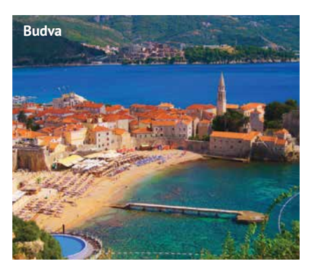
Drive to Budva, the town known as the tourist capital of Montenegro and for all the right reasons. Highlights include

Breakfast and check - out. Drive and arrival in Dubrovnik, one of the most significant monuments in the world and one of Europe's best preserved walled cities, known since the 7th century. The old town is surrounded by a 2 km long wall that gives a great opportunity to see old Dubrovnik from above during a one hour relaxing walk; the city's churches, fortifications and monuments are a real must-see. Dubrovnik has enchanted a lot of famous persons to devote their pieces of art to the city, thus in this city of marble and light coloured stone, you will find numerous art galleries and unique shops. In the historical centre of Dubrovnik, you will visit the main street Stradun, the main square Placa, Pile Gate, the Rector's Palace, Sponza Palace, the walls of the Old Town, the church of Saint Blaise, the cathedral, the Jesuit church, Orlando's Column, Big Onofrio's Fountain, the city port and other hidden gems.