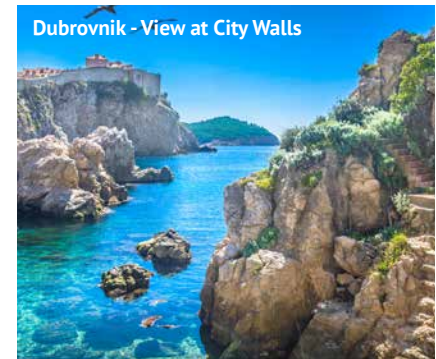
Dubrovnik - View at City Walls

famous persons to devote their pieces of art to the city, thus in this city of marble and light coloured stone, you will find numerous art galleries and unique shops. In the historical centre of Dubrovnik, you will visit the main street Stradun, the main square Placa, Pile Gate, the Rector's Palace, Sponza Palace, the walls of the Old Town, the church of Saint Blaise, the cathedral, the Jesuit church, Orlando's Column, Big Onofrio's Fountain, the city port and other hidden gems. Hotel check-in and overnight.