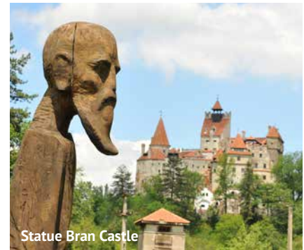
Statue Bran Castle

and the legend of Vlad Cepeș, a Romanian hero known as a very cruel ruler, and used it all as inspiration for his world-famous novel. Thanks to the fact that Vlad the Impaler was held as a prisoner in this beautiful mediaeval castle, a belief was created that Bran Castle is the place where Stoker placed his story and it became known as Dracula's Castle.