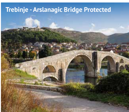
Trebinje - Arslanagic Bridge Protected

Breakfast and check-out. Drive to one of the most beautiful cities of the Balkan Peninsula, Mostar. During the walking tour, you will visit the symbol of the city, Balkan TOP 10 and the most photographed sight in the country – the Old Bridge (a UNESCO protected landmark). You will then proceed to Koski Mehmed Pasha Mosque, the Crooked Bridge and the old tanner's quarter Tabhana. Free time in Mostar for getting lunch on the banks of the Neretva River, with an amazing view of the bridge that rises above you.