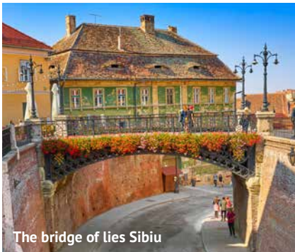
The bridge of lies Sibiu

Its historical significance is further confirmed by the fact that it was the first European city to have electric street lighting. A guided tour will leave from Unirii Square, the city's main square surrounded by beautiful mediaeval buildings among which the Catholic Cathedral of Saint George is a decorative highlight. The tour will take you to Liberty Square, Victory Square home to the Romanian National Opera and National Theatre, and the 15th century Huniade Castle which today represents the best example of Gothic architecture in this region.