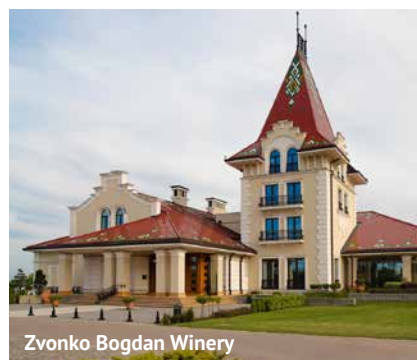
Zvonko Bogdan Winery

Breakfast. Drive to Belgrade. Today you will explore the most interesting sights of Vojvodina, a province in the north of Serbia. After a leisurely drive through the Pannonian Plain, you will reach the pearl of secessionist architecture, the Zvonko Bogdan Winery. The magnificent building, which clearly points to the almost inevitable blend of wine and art, was built in the style of traditional architecture of the nearby town of Subotica. During a one-hour guided tour, pay attention at different works of art displayed in the winery and enjoy tasting three different wines made from grapes from the Palic vineyard.