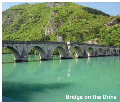
Bridge on the Drina